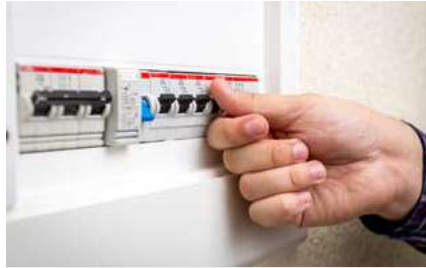
EICR (Fixed Wire Testing)