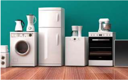
Electrical Equipment Testing (PAT Testing)