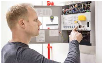
Fire Alarm Testing and Servicing