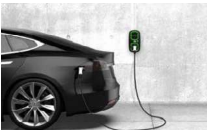
Electric Car Charging for Businesses - Installation and Maintenance of EV Points