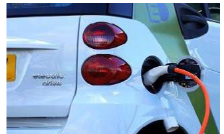
Electric Car Charging Point Grants available and the Criteria - EVHS and WCS

Hawkesworth (Hawkesworth Appliance Testing Ltd.) Guidance House | York Road | Thirsk | North Yorkshire | YO7 3BT | 01845 524498 | www.hawkesworthappliance-testing.co.uk | enquiries@hawktest.co.uk