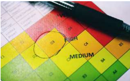
Fire Risk Assessments