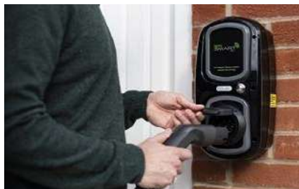
Electric Car Charging at Home - Installation and Maintenance of EV Points